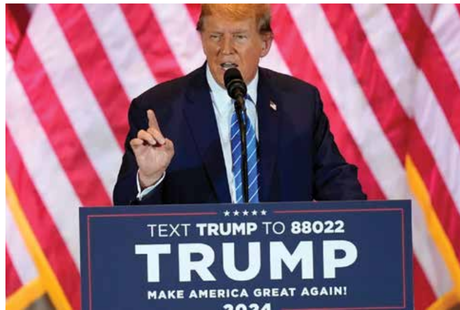
Trump repite su deseo de querer inmigrantes de Europa.

varias ocasiones que implementará una dura política de detenciones y deportaciones, así como otras estrategias migratorias.